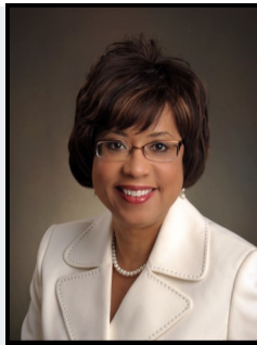
Judge Rhonda Hunter