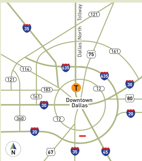
General trail location shown in red above.

This map is for informational purposes and only represents the approximate relative locations of the labeled features. This map was published in January 2014.