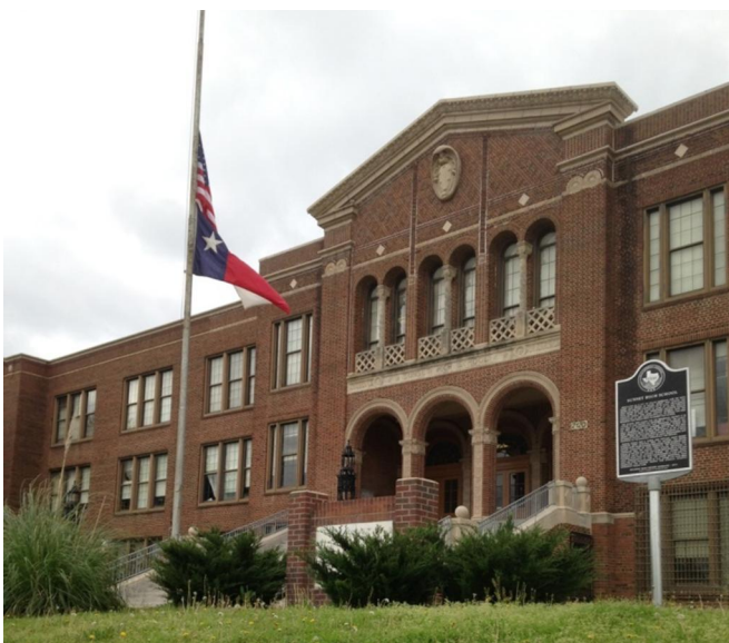
Sunset High School

Now over ninety years old—and the sixth-oldest high school in Dallas, Sunset High School has recently been designated as both a Recorded Texas Historic Landmark by the State of Texas and as a City Landmark by the City of Dallas.