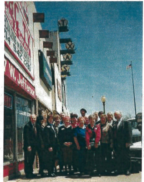
DCHC members toured the Texas Theatre after a recent meeting in Oak Cliff.

Cultural districts are breathing new life into communities by using the arts to attract people and businesses to strug-