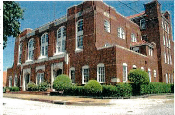
Old YMCA building to be new home for Dallas Black Dance Theatre