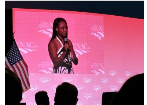
Left: The attendees at the annual NACo business meeting. Middle: The countywide strategic plan presented for a Maryland county during the Building Equity into Governance session. Right: Olympic gold medal gymnast Dominique Dawes delivers the keynote speech during the NACo annual business meeting.