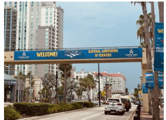
Left: The iconic stingray statue located at the entrance of the Florida Aquarium. Middle: Meeting guests attend the National Association of Black County Officials meeting during the NACo conference. Right: The bridgeway between a local hotel and the Tampa Bay Convention Center welcoming the attendees of the NACo conference.